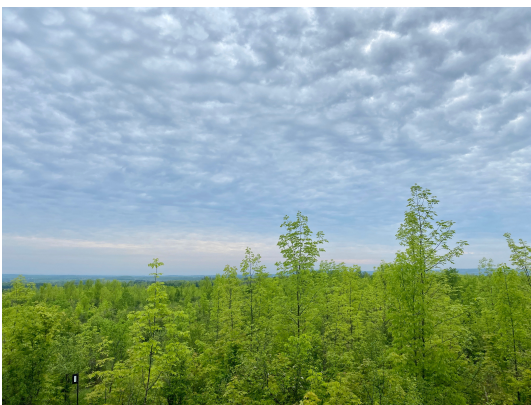
Why take this?

Think: Will any of these photos tell a memorable story? One you'll want to look back on in 10 years time?